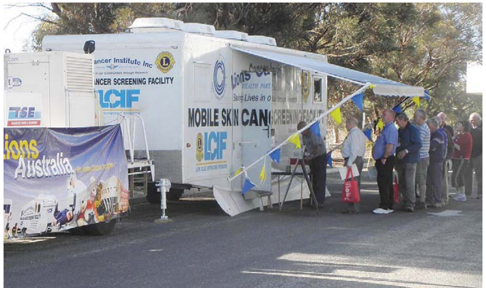
A long queue of patients waiting to get tested for skin lesions at the Mildura convention.

Delegates and their partners flowed steadily during the weekend and again some astonish-